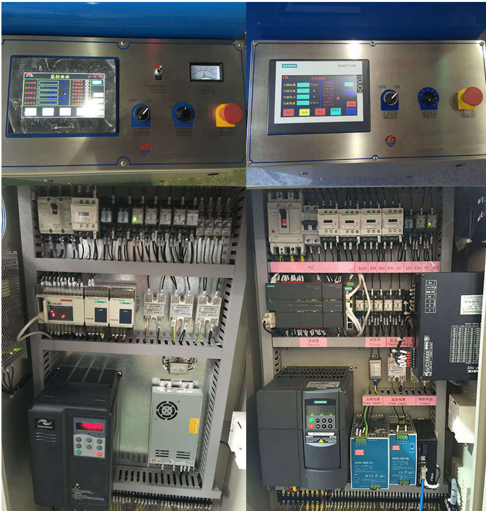
Power Cabinet: Embedded type / plug in type / Stand alone type

Siemens standard: Siemens HMI & PLC & Invertor+Siemens Motor