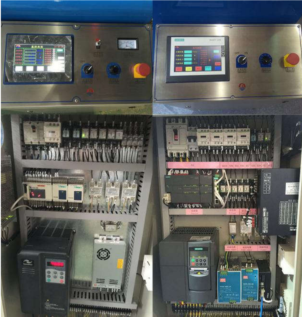
Power Cabinet: Embedded type / plug in type / Stand alone type